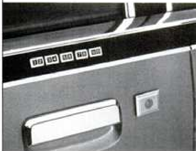
Keyless entry system uses pushbuttons mounted on driver's door for multiple functions besides entry. Conventional key-type lock gives owner manual override, in case of failure.

The LTD II and non-XR-7 Cougar lines have been discontinued. These cars, nominally intermediates, have been temporarily replaced by putting more emphasis on the carry-over Granada and Monarch for one year. A new line will be introduced in '81. ■