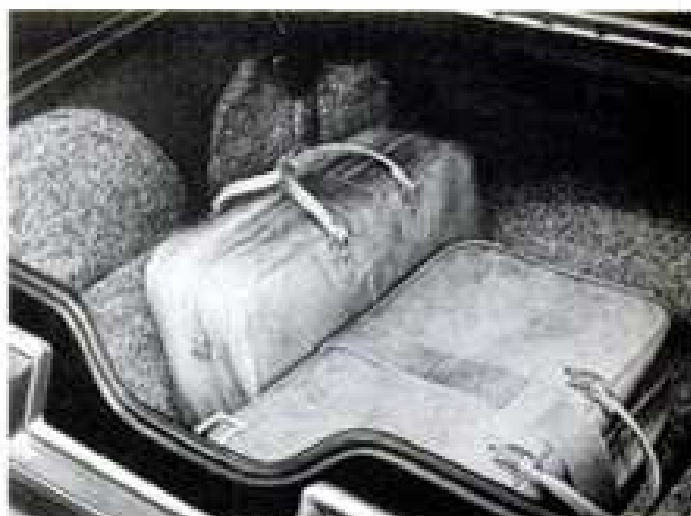
Deep trunk on Thunderbird (and XR-7) provides a lot of usable space for easy packing of bulky items. Lifter height is high, but the design helps to give the body extra stiffness.