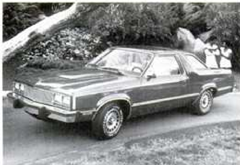
Zephyr sedans also get turbo engine option, including California models. Engine

fuel-economy benefits of the four-cylinder engine will be mostly lost if you make much use of the turbocharger's boost. That can make the turbo four less fuel-saving than an efficient six of a greater displacement.