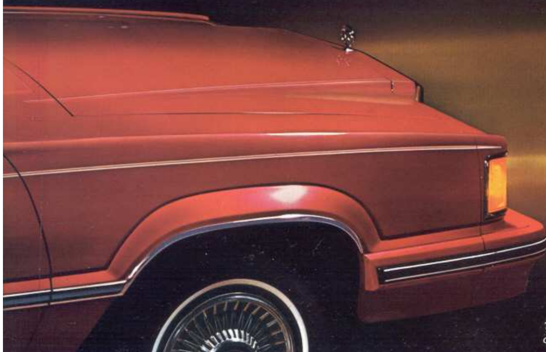
'82 XR-7 GS in Medium Red with optional flip-up/open air roof.