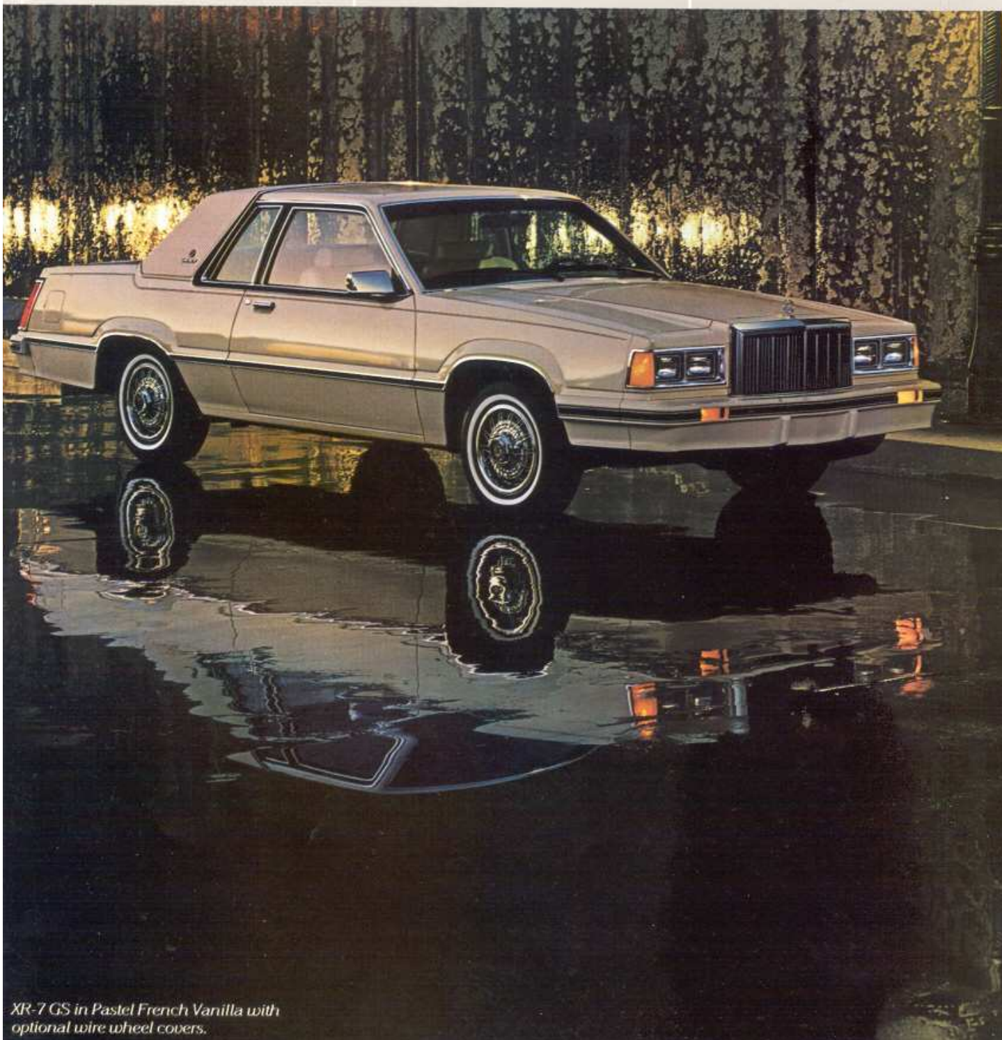
XR-7 GS in Pastel French Vanilla with optional wire wheel covers.

Yet, what truly makes the GS so exceptional is the fact that it offers more. More standard equipment in the form of