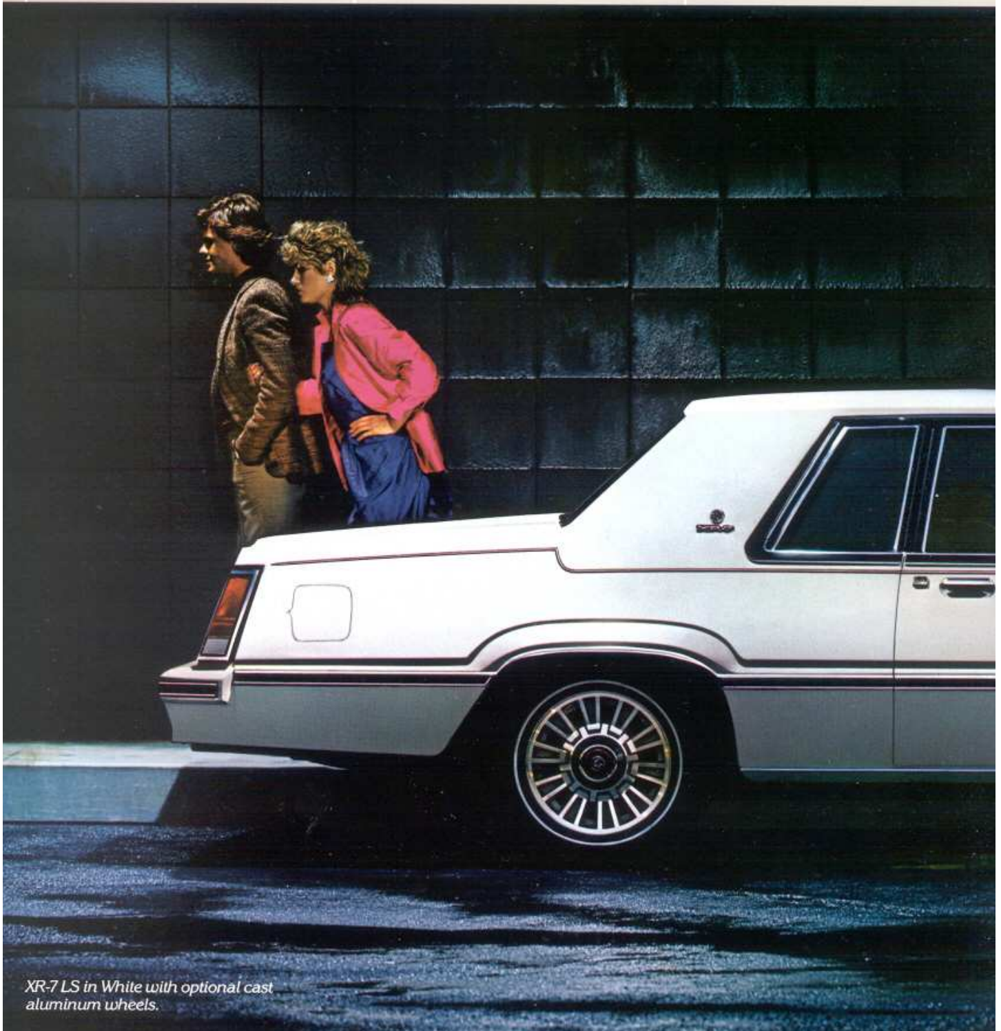
XR-7 LS in White with optional cast aluminum wheels.

lines of authority. While other standard model features like the padded, half-vinyl roof, dual remote-control outside mirrors, bright LS luxury wheel covers, and the distinctive XR-7 hood ornament heighten the unmistakable aura of the LS.