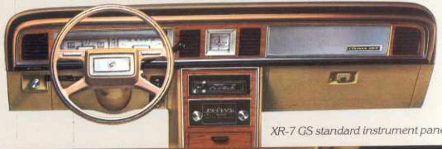
XR-7 GS standard instrument panel.

There's also a soft, rear-seat armrest, full wheel covers, and thick cut-pile carpeting. Inside and out, the XR-7 GS is a car to sit in as well as be seen in.