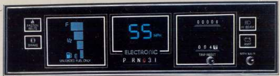
XR-7's optional Electronic Instrument Cluster.

digital clock with day, date, and time readouts. Or choose the Diagnostic Warning Light System. It alerts you via a flashing light if you're low on fuel or washer fluid; if your low beam headlight, brake light, or taillight is out; if your door is ajar; even if you've accidentally left your headlights on. The XR-7 L.S. It's an exquisite opportunity to take an elegant car . . . and turn it into a beautiful expression of you.