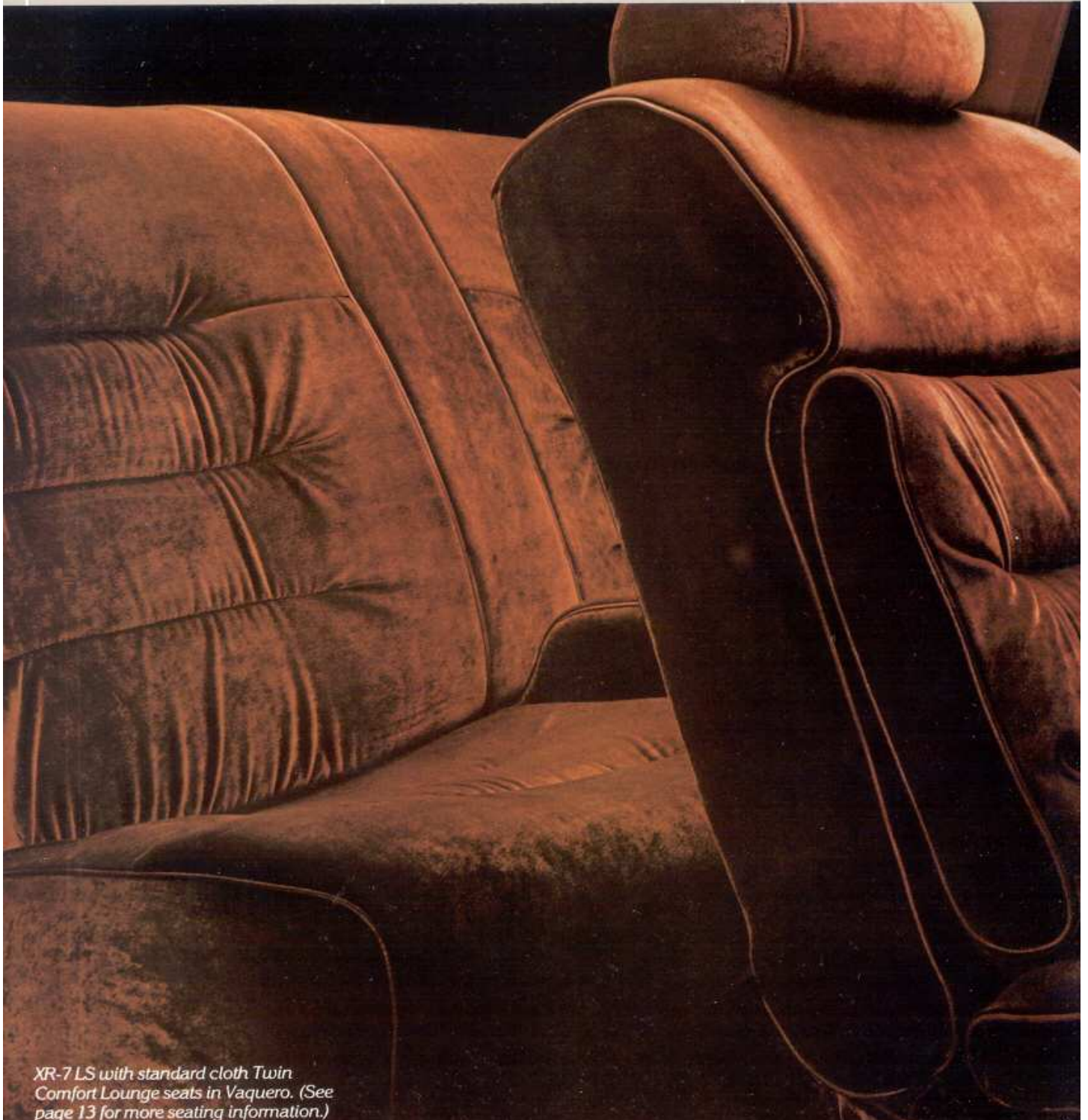
XR-7 LS with standard cloth Twin Comfort Lounge seats in Vaquero. (See page 13 for more seating information.)

Furthermore, several optional packages are available which take you totally into a new realm. For instance, the Electronic Instrument Cluster offers an amazing array of "high-tech" instruments: digital speedometer, electronic fuel gauge, and a