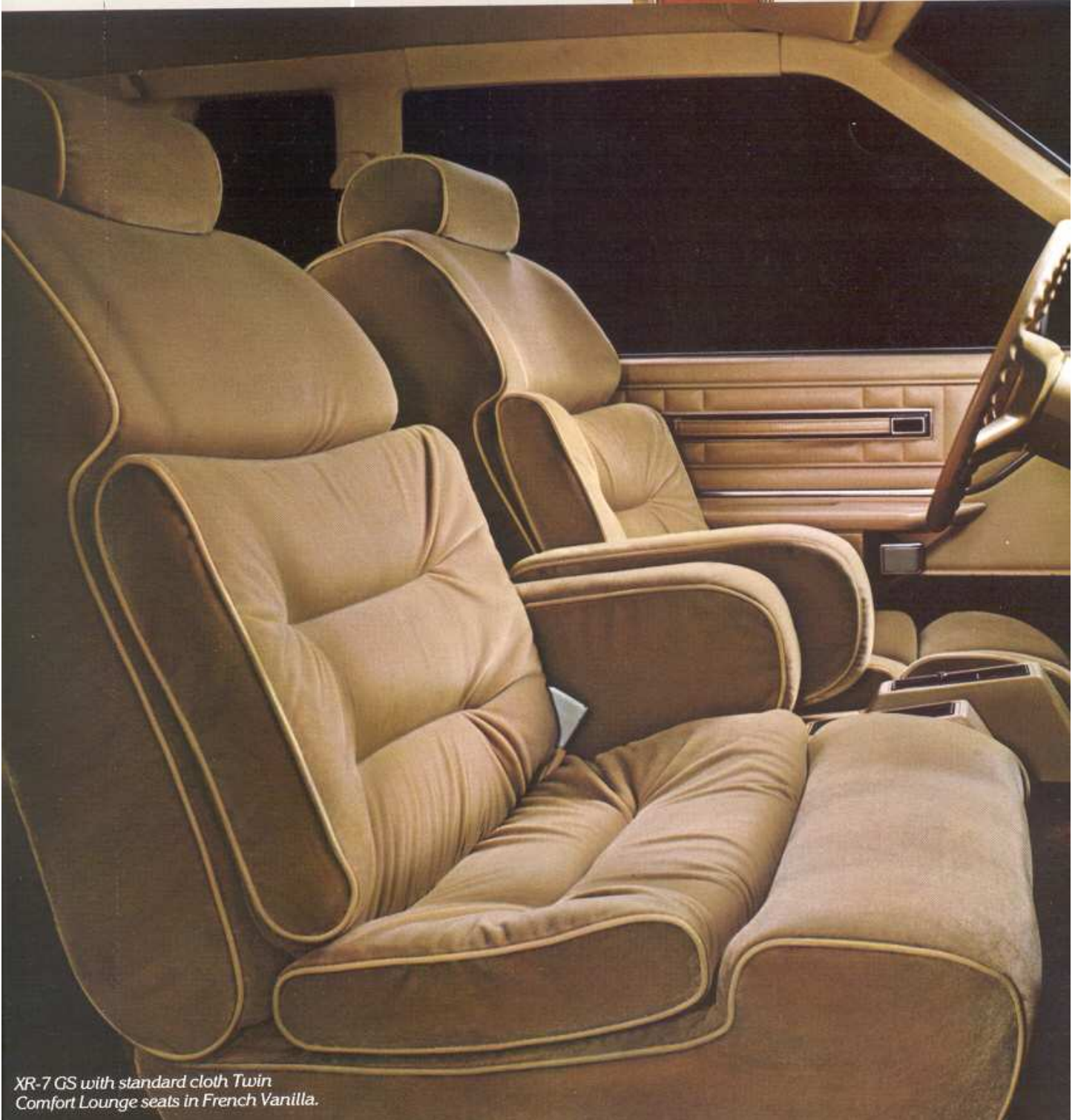
XR-7 GS with standard cloth Twin Comfort Lounge seats in French Vanilla.