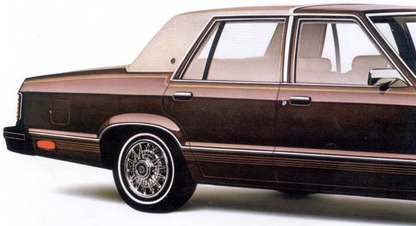
COUGAR LS four-door, in Dark Brown Metallic, with stylish half-vinyl roof in Light Fawn, and optional wire wheel covers.