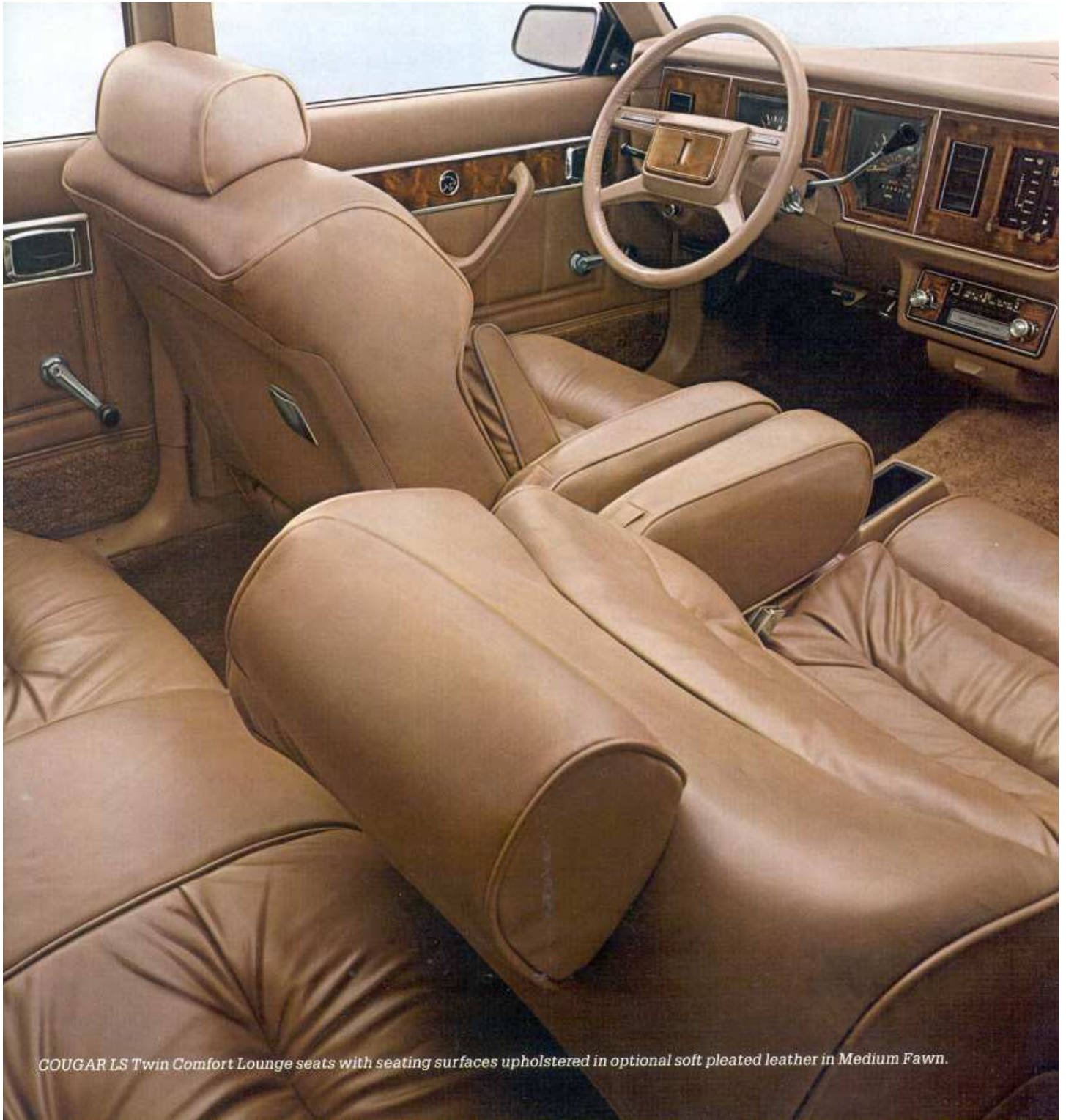
COUGAR LS Twin Comfort Lounge seats with seating surfaces upholstered in optional soft pleated leather in Medium Fawn.