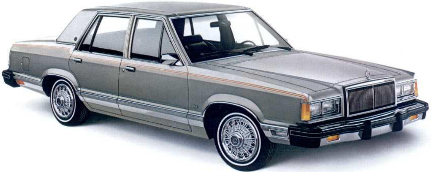
COUGAR GS four-door, in optional Tu-Tone Light Pewter Metallic/Medium Pewter Metallic, with optional Light Pewter vinyl roof and wire wheel covers. COUGAR two-door, in Black, with optional vinyl roof and standard wheel covers.