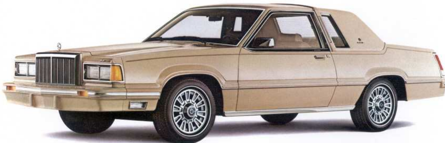
COUGAR XR-7 GS, in Fawn, with optional half-vinyl luxury roof, TR-type tires, and aluminum wheels.