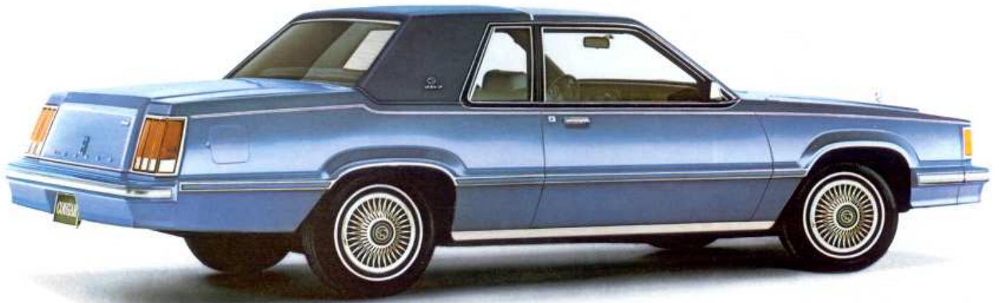
COUGAR XR-7 GS in Medium Blue Metallic with Midnight Blue vinyl roof and luxury wheel covers. COUGAR XR-7 in Black, with wire wheel covers.