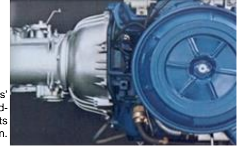
Versailles' engine is hand-matched to its transmission.