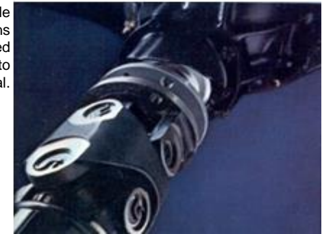
A double coupling joins balanced driveshaft to differential.