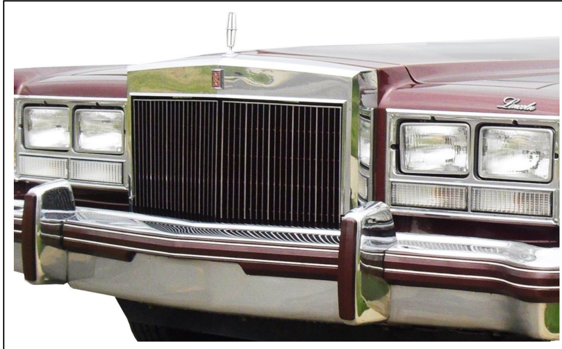
THE 1980 LINCOLN GRAND VERSAILLES