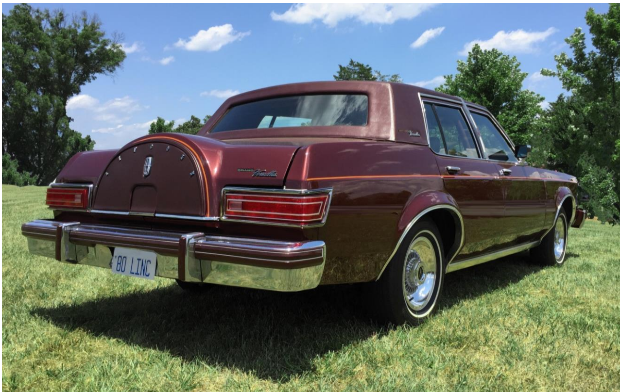
1980 Lincoln Grand Versailles in Dark Cordovan and Bittersweet pinstripes with aluminum dish wheels